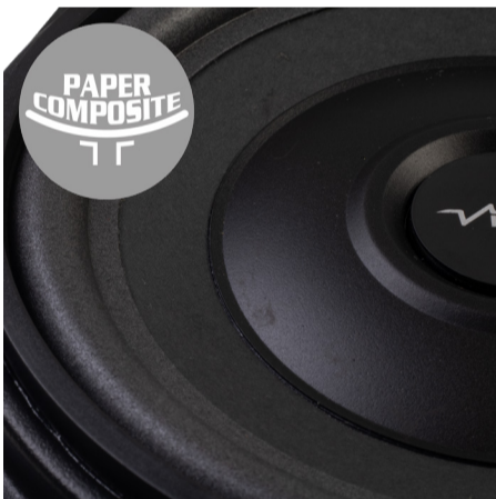
PAPER COMPOSITE CONE

PREMIUM BUILD - In order to integrate into premium vehicles we supply premium products, with high quality parts such as Neodymium motors, pressed foam surrounds, gold plated terminals and steel torsion baskets, Our BMW subwoofers far exceed the OEM speakers.