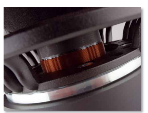
Around the voice coil with ample stroke reserves, there is also a lot of free space

Close to perfection, this also describes the sound quality the PRO 10 effortlessly yields. It feels like it performs at any desired depth, and is quaranteed to do so with official precision. The way it just perfectly reproduces individual bass beats even at the lower end will fill you with pure joy. There is even more pressure than enough thanks to the incre-