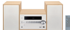
Vertical speaker setup