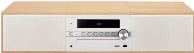
X-CM56D(W) Horizontal speaker setup