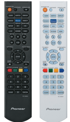
For white model

In addition to spectacular video experience with Ultra HD (4K/24p) upscaling, the BDP-X300 Blu-ray 3D™ Disc player offers high-quality sound reproduction for your audio entertainment, with Hi-Res Audio playback, exclusive audio DAC circuit board and shielded power supply, and HQ Sound feature. The BDP-X300 comes in a matching design and colours with Pioneer's AV receivers, including the anti-standing wave insulator, letting you enjoy a neat setup. As a universal media player, the unit provides easy playback of various sources with built-in Wi-Fi®, Miracast™, and DLNA™.