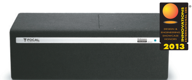
DSA 500 RT has been awarded the CES Innovation 2013

With 600 Watts available, the power supply module is specifically designed for audio applications and the supply of energy is excessive and fast (low resistance), resulting in optimal control of audio "transients" . With a surface area of just 6x8cm, spread over a 4-layer PCB, it ensures constant performance even on audio content requiring sizeable dynamic scope . Equipped with special self-induction filters inductors manufactured according to strict Focal specifications, the class D amplification is virtually on a par with AB class performances , while the THD is approaching 0.07%. The Texas Instruments® audio processor offers comprehensive digital PWM (Pulse Width Modulation) management from the input to the 300 Watts of the final stage amplification.