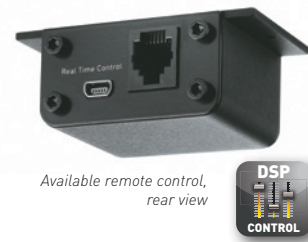
Available remote control, rear view

The DSA 500 RT is primarily a subwoofer : THE low frequency extension solution, which resolves potential vibration issues. As such, you avoid stretching the limits of the system and putting strain on the door speakers.