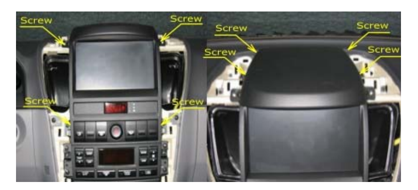
Remove 8 screws and remove front en upper panel complete.