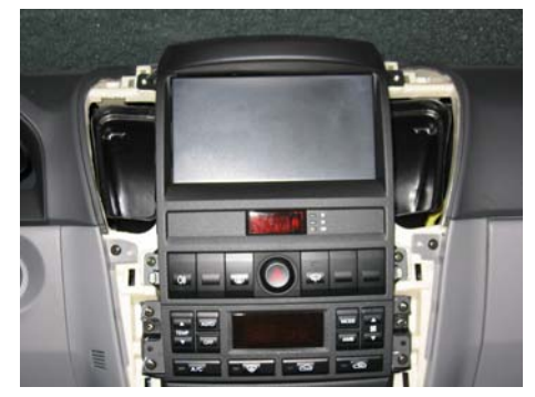
Use plastic wedge to remove panel on left and right side.