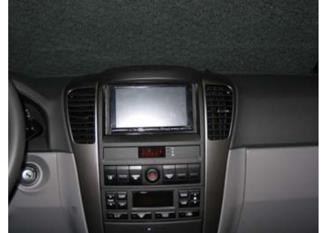
Place panels back in reverse order.

Connect all of the needed wiring harnesses and check all connections carefully