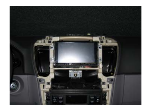
Place head unit including mounting plates and supporting bracket.