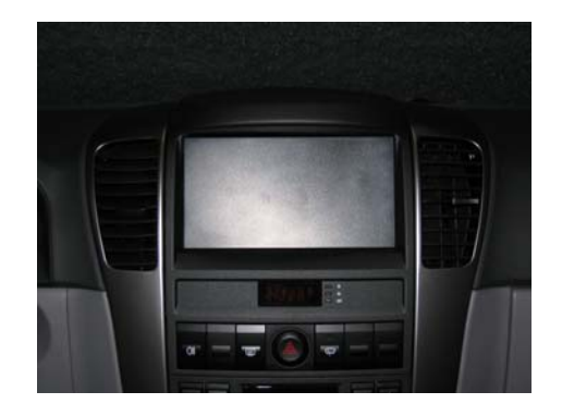
Car is equipped with original head unit or plastic cover.